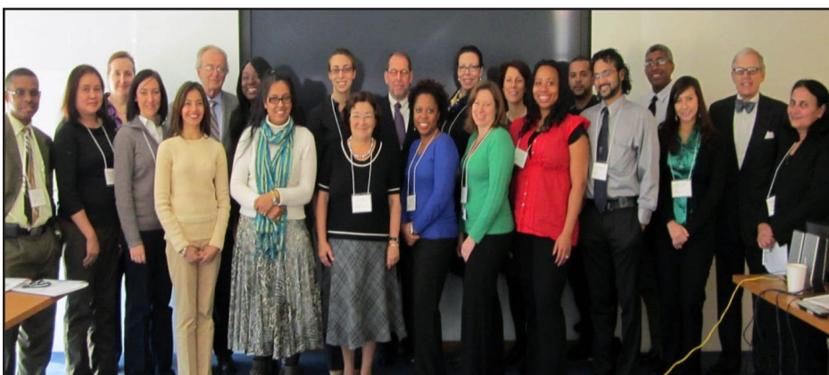
Community Engaged Research Core