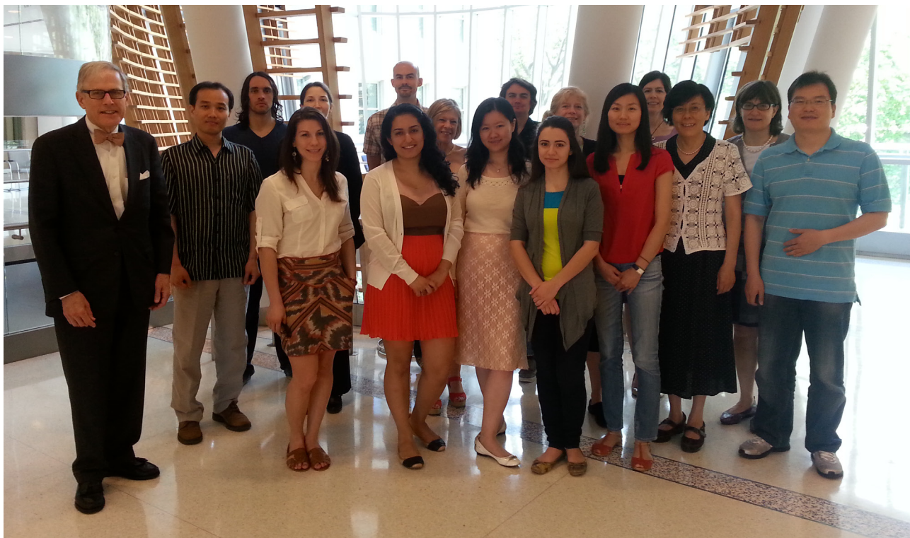
2012-2013 Certificate Course participants

The Certificate Program is next scheduled for the academic year beginning in September 2014.