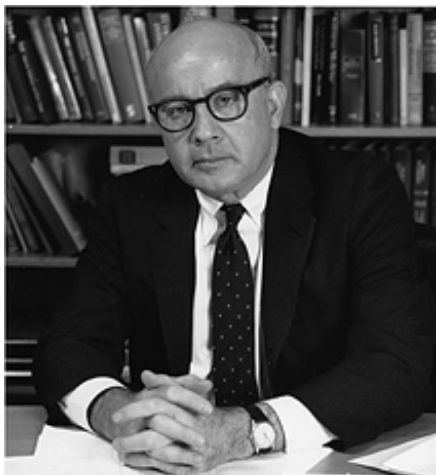
Kappas, Attallah

Proteins, carbohydrates, and fats in foods can affect the manner and rapidity with which the body—principally the liver—processes and biotransforms drugs, and thus alters the drugs' effectiveness. In 1976, Attallah Kappas (1926- ) and colleagues at the Rockefeller Hospital began a series of exacting metabolic studies in humans that first defined the specific effects of diet components on drug metabolism. The research focused on a class of proteins active in the liver known as cytochromes P450. These molecules contain heme, and it was Kappas' long-term interest in metabolic pathways related to heme in the liver that led him to study the effects of controlled, calculated, diets on P450-mediated chemical biotransformations in humans. The results of these studies helped to establish a firm scientific foundation for the developing field of nutritional pharmacology.