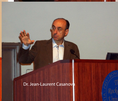
Dr. Jean-Laurent Casanova