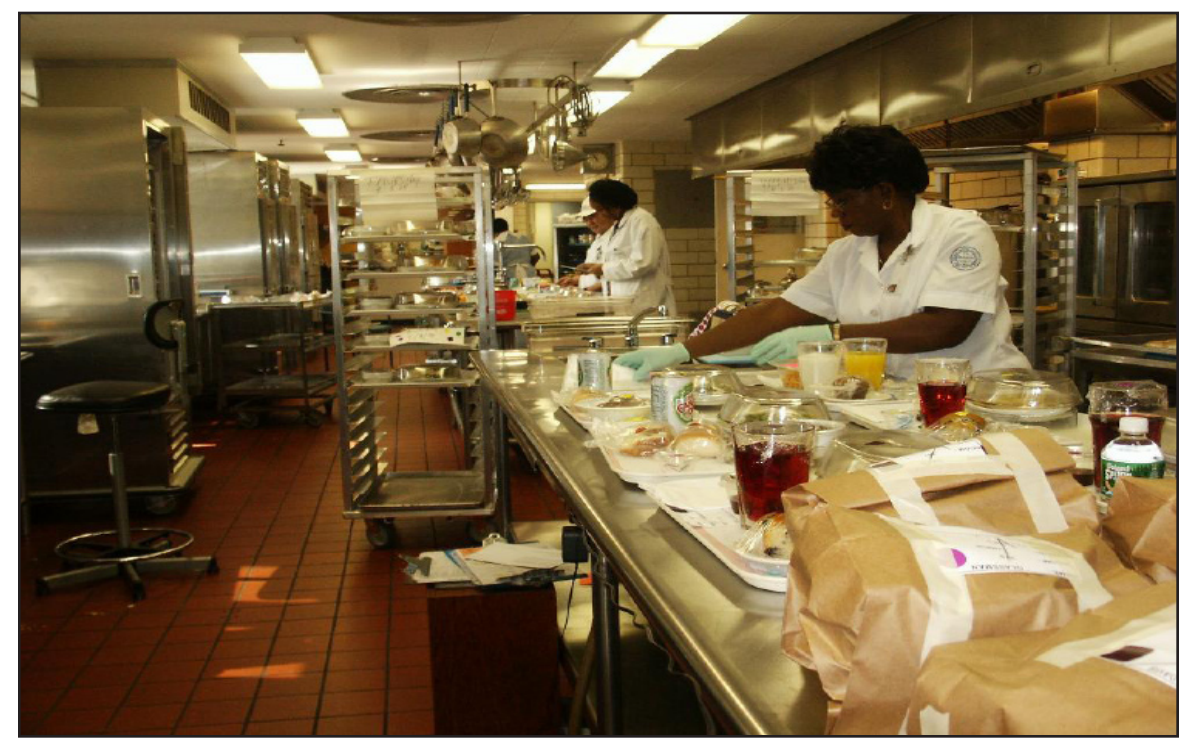
The Bionutrition Department

Education Two highly valuable, user friendly tools developed in the program that benefits the intern is the calendar function, which establishes a working schedule for the user and a competency checklist that ensures regulatory compliance. The Board of Directors of NAB reviewed the template and approved it. As a result, the Dietetic Intern/Dietetic Student "Preceptor Tool Kit" is now available to